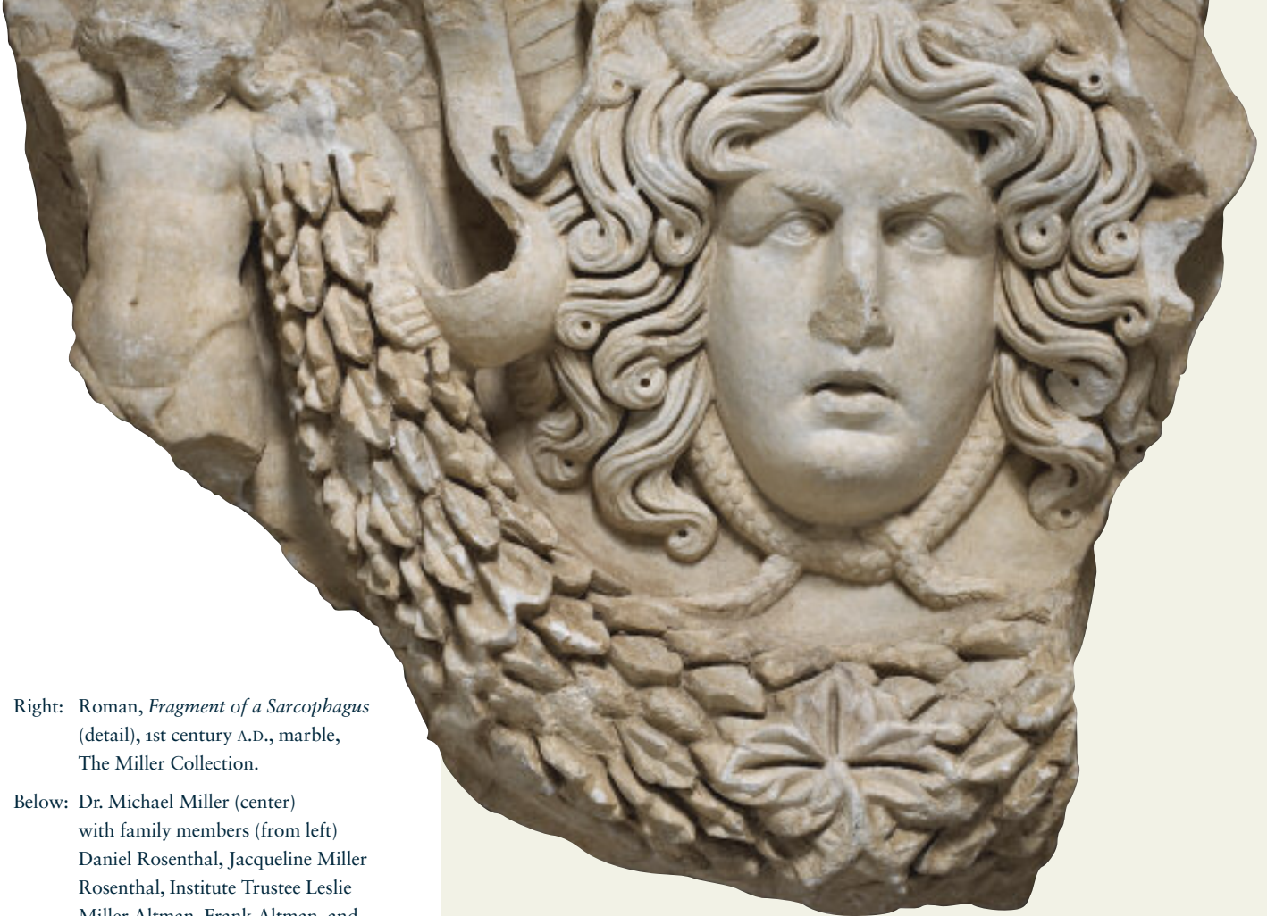
Right: Roman, Fragment of a Sarcophagus (detail), 1st century A.D., marble, The Miller Collection.